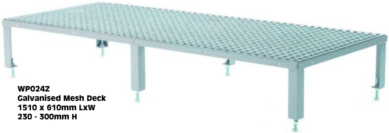
WP024Z Galvanised Mesh Deck 1510 x 610mm LxW 230 - 300mm H