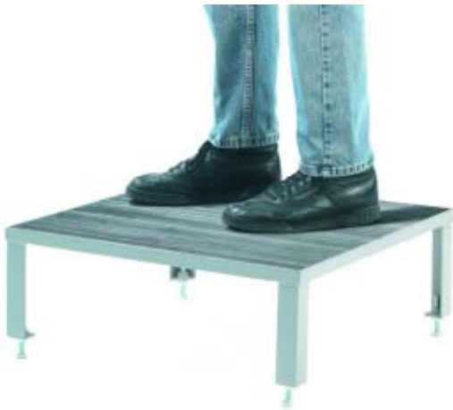
WP041Z Phenolic Non-Slip Plywood Deck 610 x 610mm LxW 230 - 300mm H