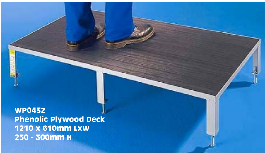
WP043Z Phenolic Plywood Deck 1210 x 610mm LxW 230 - 300mm H