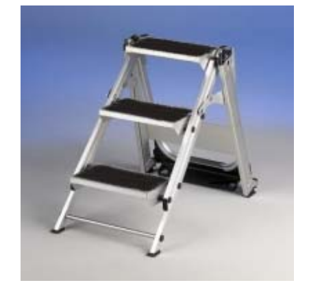
for maximum safety and comfort, which will support whole feet but closes to just 5" thick!

Great for use in offices, stores, warehouses etc