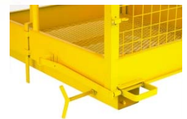
>> Fork heel lock and screw jack