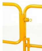
<< Raised gate lock and slam bolt