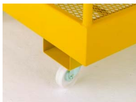
Optional Wheel Set