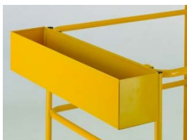
Optional Tool Tray