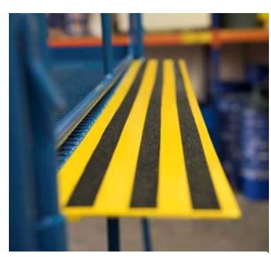
Optional Accessory: Platform Extension for longside to close off any gap between platform and mezzanine