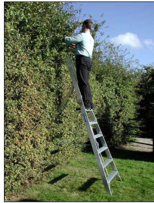
Rear support leg pushed into hedge allows safe face-on working rather than reaching to one side from a pair of normal steps.

For prices of these and full details of our huge range of ladders, steps, podium steps and scaffold towers, visit us at our web site