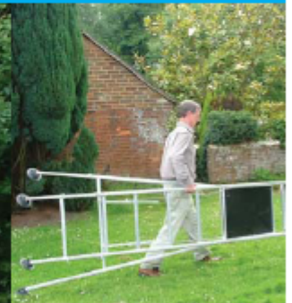
Easy to move