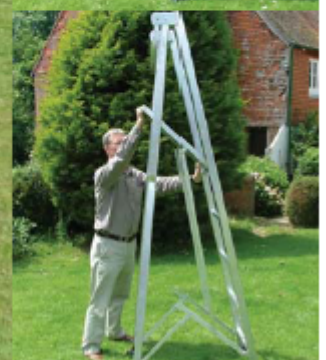
Easy to open