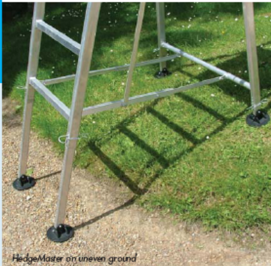
HedgeMaster on uneven ground

There are three models available and for each model we offer a height extender, which can be fitted without tools.