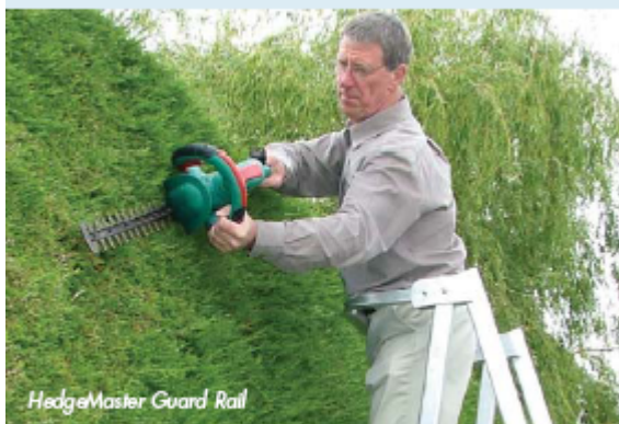
HedgeMaster Guard Rail