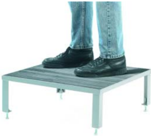
GS041Z Ribbed Rubber Deck 610 x 610mm LxW 230 - 300mm H