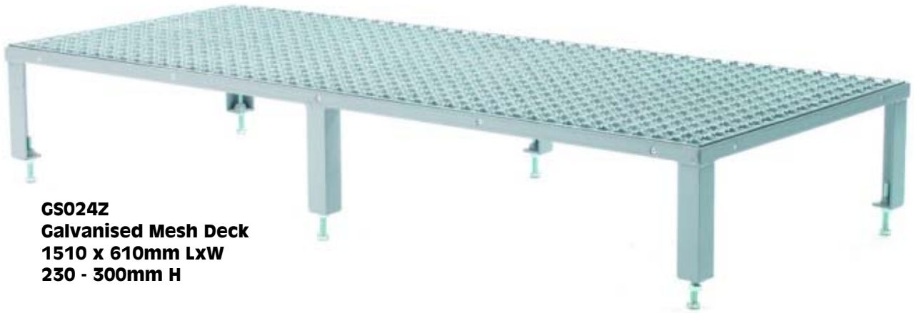
GS024Z Galvanised Mesh Deck 1510 x 610mm LxW 230 - 300mm H