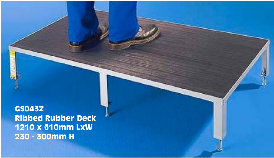
GS043Z Ribbed Rubber Deck 1210 x 610mm LxW 230 - 300mm H