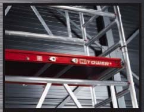
Strong & Robust