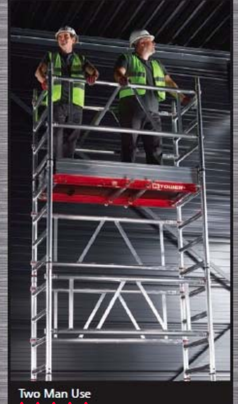
Easy-clip frame clips