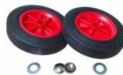
Extra Large Wheels 250mm diam