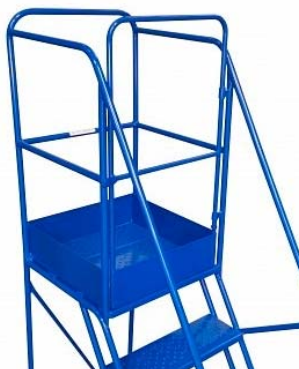
Platform Front Entry Gate (or Chain or Bar) or Platform Rear Exit Gate