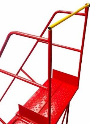
Rear Exit with Bar (or Gate or Chain)