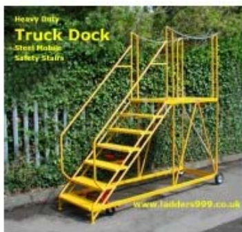
TRUCK DOCK Mobile Safety Steps