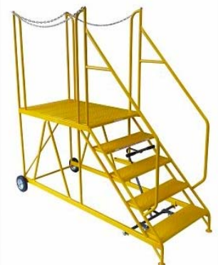
Truck-Dock Unloading Stairs with safer, shallower tread pitch at 48 degrees