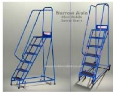
NARROW AISLE Mobile Safety Steps