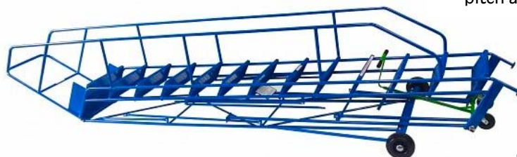
Knock-Down Mobile Safety Steps ... easier to move into tight & awkward areas