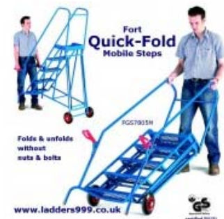
Fort QUICK-FOLD Mobile Safety Steps