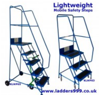
LIGHTWEIGHT Mobile Safety Steps