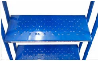
Standard Punched Steel treads