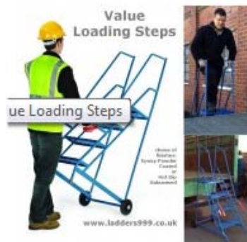
Value Loading Steps