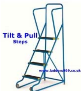
TILT & PULL Steel Steps