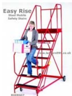
EASY RISE Mobile Safety Steps