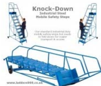
KNOCK-DOWN Mobile Safety Steps