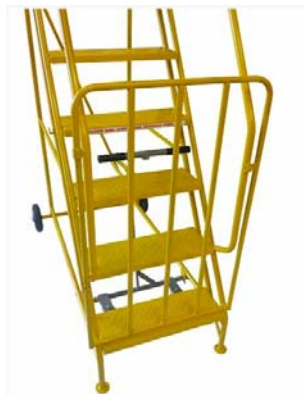
Base Entry Gate