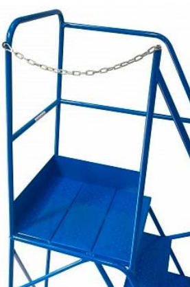
Side Exit with Chain (or Bar or Gate)