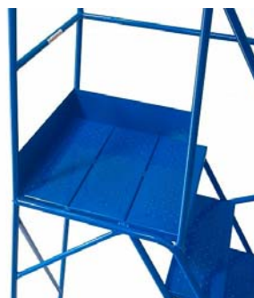
Platform Length Extensions