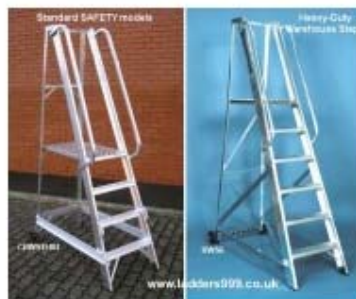
ALLOY Warehouse Steps