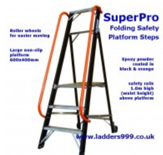
SuperPro Folding Safety Platform Steps