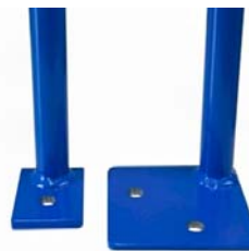
Fixed Plate Feet