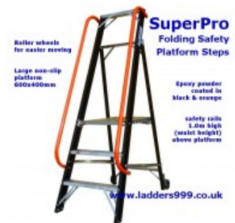
SuperPro Folding Safety Platform Steps