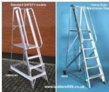
ALLOY Warehouse Steps