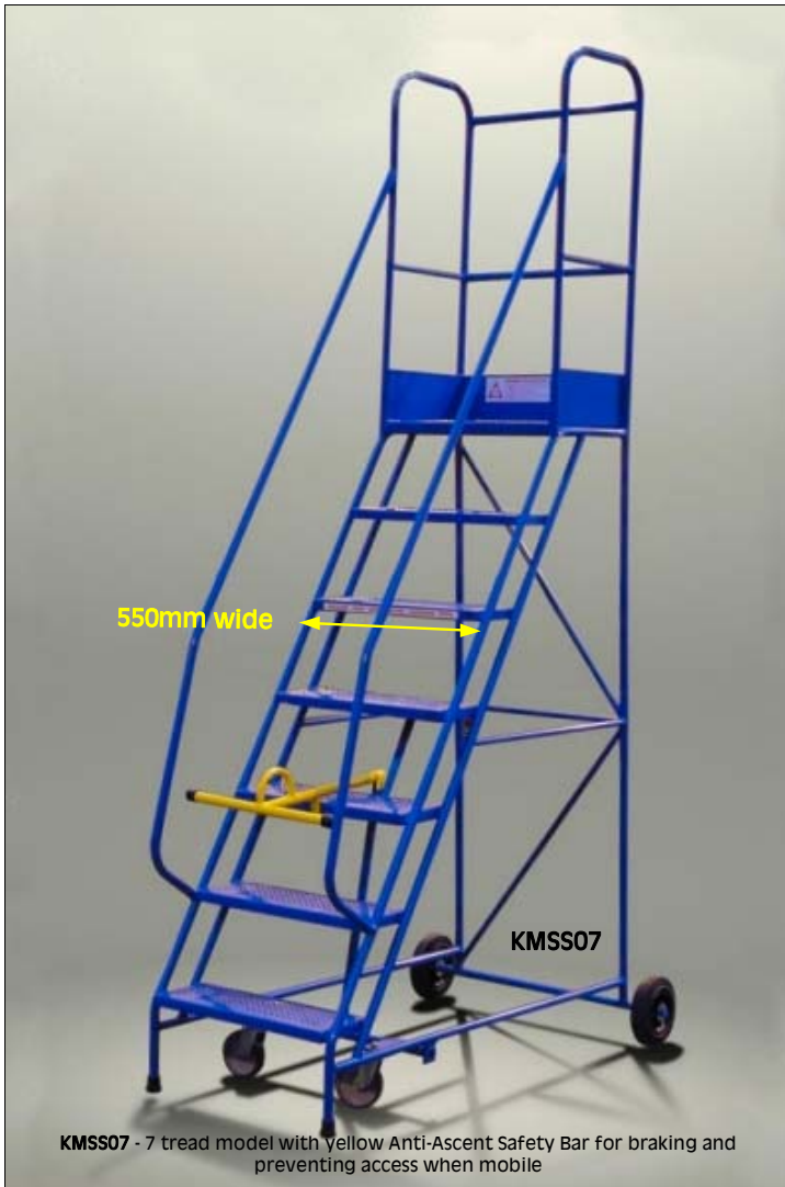
KMSS07 - 7 tread model with Yellow Anti-Ascent Safety Bar for braking and preventing access when mobile