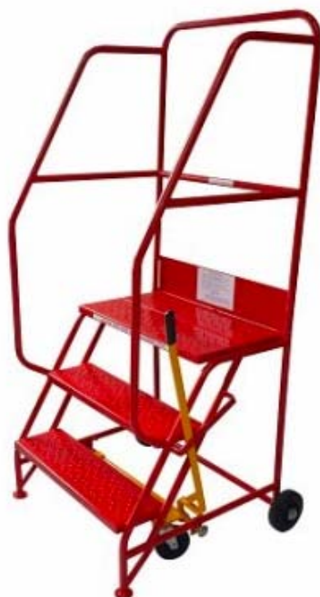
KMSS03 - 3 tread model with Side Braking Lever and optional deep Red polyester powder coating