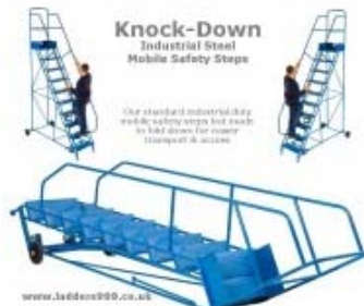
KNOCK-DOWN Mobile Safety Steps