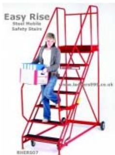
EASY RISE Mobile Safety Steps