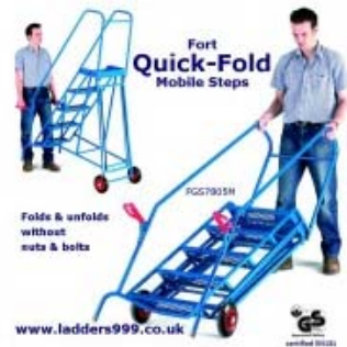
Fort QUICK-FOLD Mobile Safety Steps