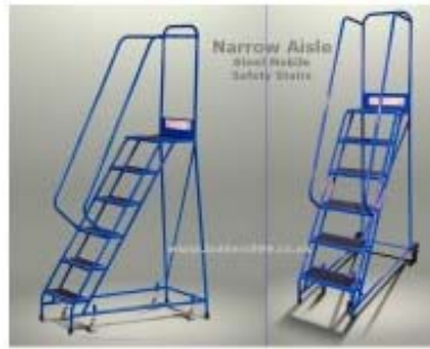
NARROW AISLE Mobile Safety Steps