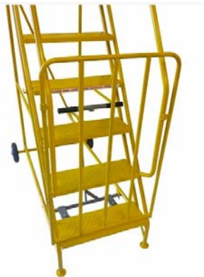
Base Entry Gate