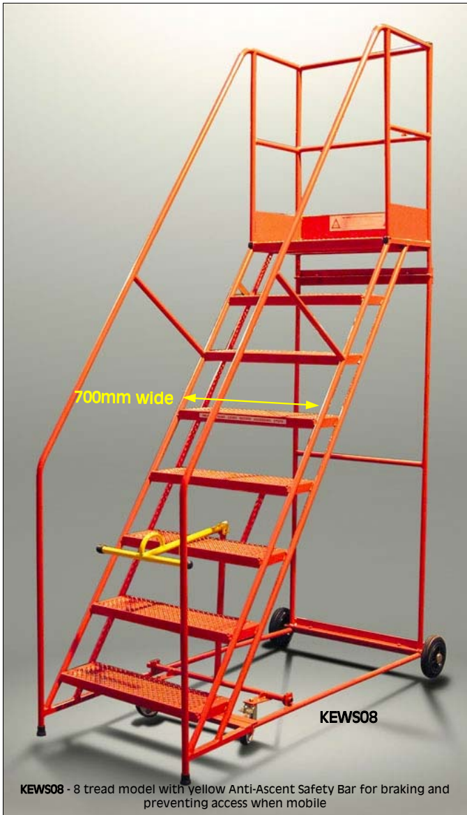
KEWS08 - 8 tread model with yellow Anti-Ascent Safety Bar for braking and preventing access when mobile