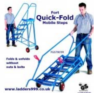
Fort QUICK-FOLD Mobile Safety Steps