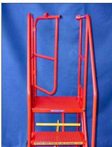
Optional Hinged Gate fitted at platform for exit to rear.