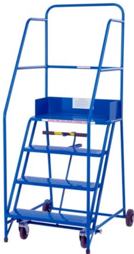
KEWS04 - 4 tread model with optional deep Blue polyester-powder coating