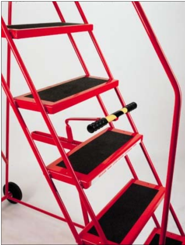
Optional non-slip PVC covered treads and optional deep Red polyester powder coated finish