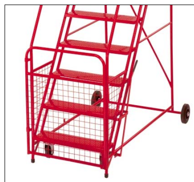
Wide Tread model with optional security Hinged Gate at base and Side Lever for braking.