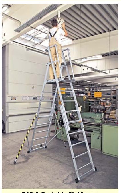
ZAP Adjustable Platforms