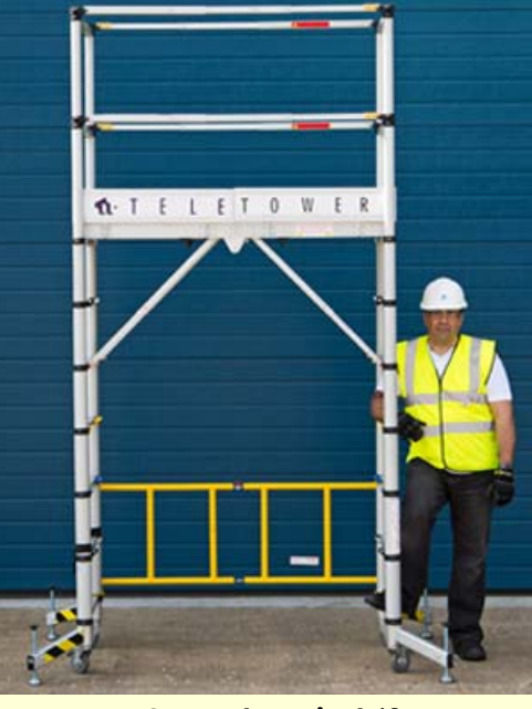
TELETOWER Telescopic Platform