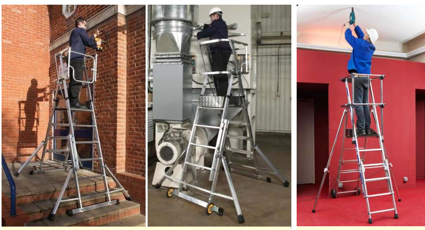
TELEGUARD Adjustable Platform