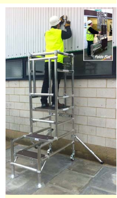
STEPFOLD Podium Steps