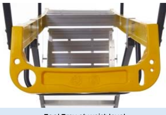
Tool Tray at waist level

Climb-It Glassfibre Podiums are folding work platforms approved to new EN131-7 PROFESSIONAL standard with max safe load 150kg, designed to comply with all UK Health & Safety requirements and are electrically insulated to 30,000 volts.