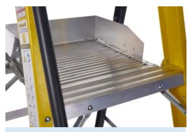
Large Platform 475mm x 406mm