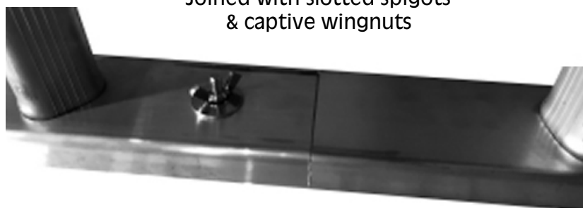
Joined with slotted spigots & captive wingnuts

Packed size of VLS50 (L x W x D) 1100 x 470 x 330mm 43" x 19" x 13"