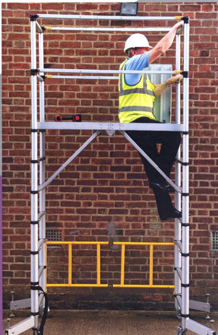
Large climb-through platform hatch