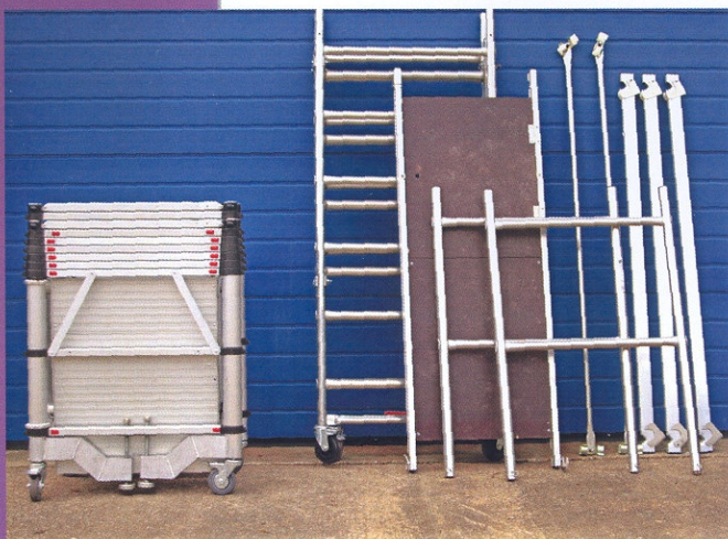
Teletower shown against a standard 2 metre tower