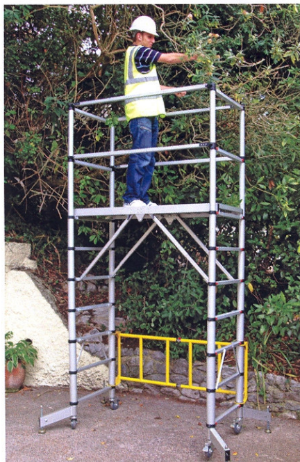
Can be used on uneven ground utilising stabiliser legs