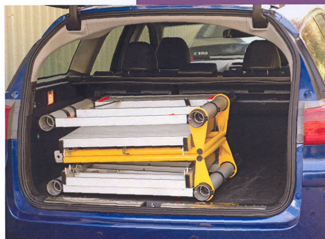
Can be transported in an estate car or small van