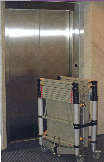
Minimal footprint allows ease of transportation and storage