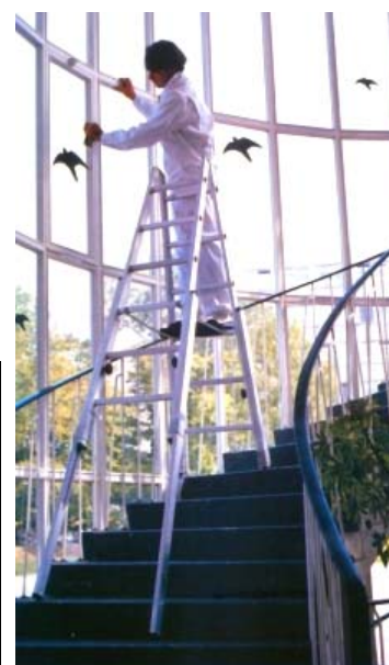
Z600 Stepladder with Extending Stiles - approved to Euro standard EN131

Not stocked. Made-to-order and imported for FREE delivery most of UK in 3 - 6 weeks.