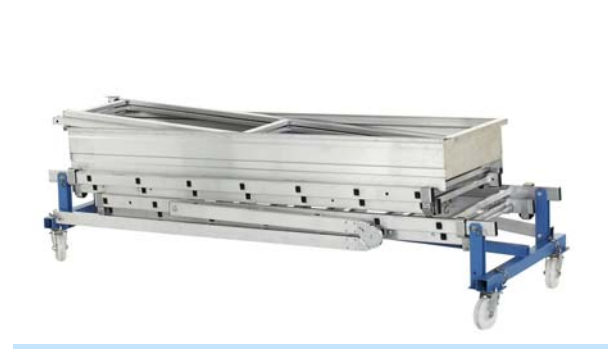
ZAP scaffold stores & transports easily when folded